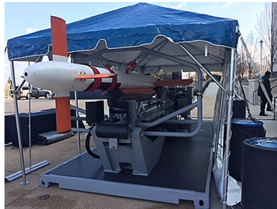
Fairlead's LARS on display at the 2018 Sea-Air-Space Expo in National Harbor, MD

The LARS is comprised of multiple aluminum weldments and highly machined components fabricated and integrated. Final machining on LARS unit incorporating a surface profile of .003 maximum restrained inspected deviation .001 across the entire 179.00" long bolted-together monorail.